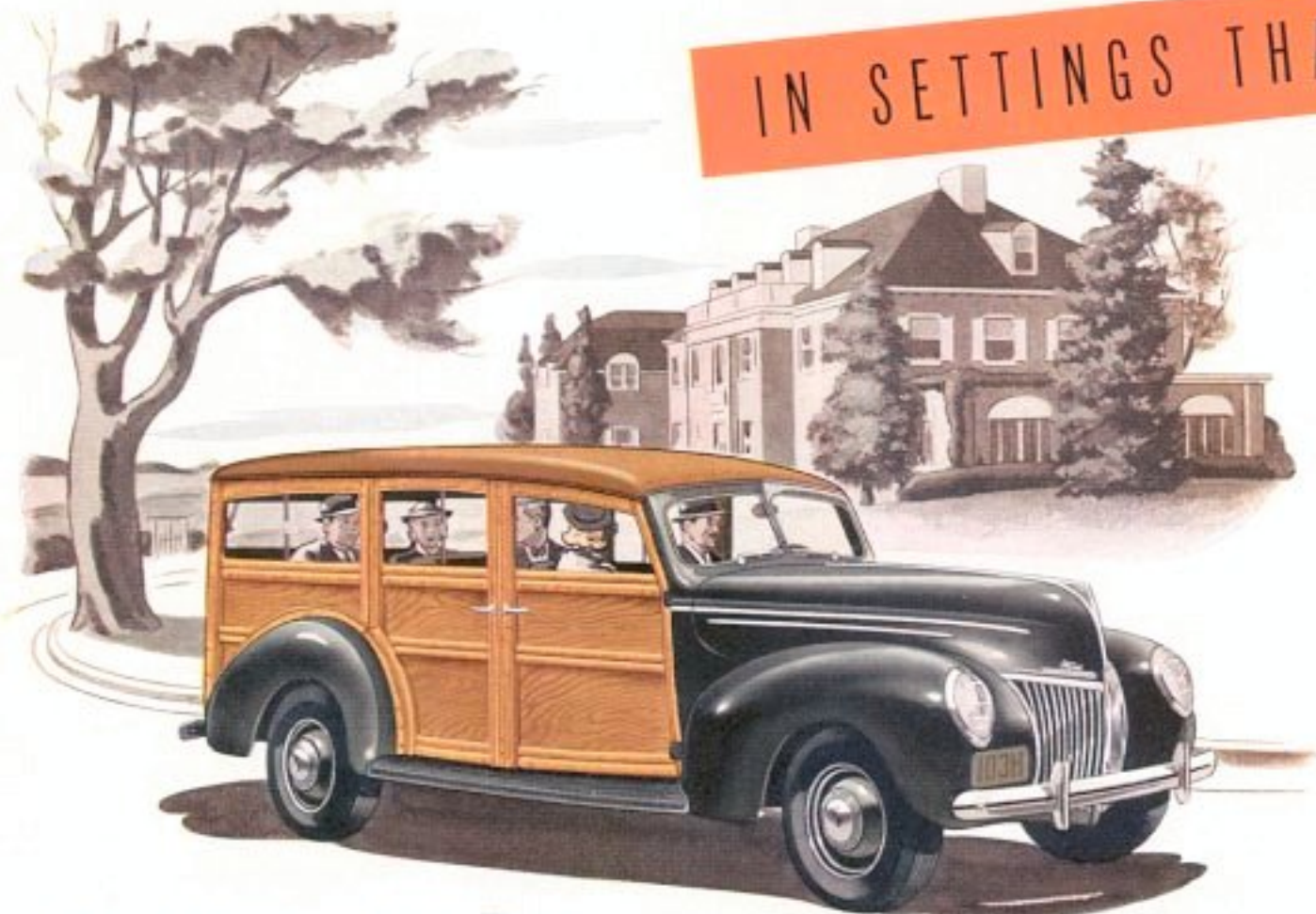
● Ford V-8 De Luxe Station Wagon

The De Luxe Ford V-8 Station Wagon is almost a necessity to the country home owner. More beautiful than ever before, it is a gracious agent of hospitality . . . greeting your guests at depot, airport, or dock, and whisking them to your doorstep. Thereafter it continues in dozens of varied tasks . . . transporting supplies, and doing general utility duty. It is appropriately styled to serve in settings that call for beauty . . . and built to conform in every respect with Ford standards of reliability and long life.