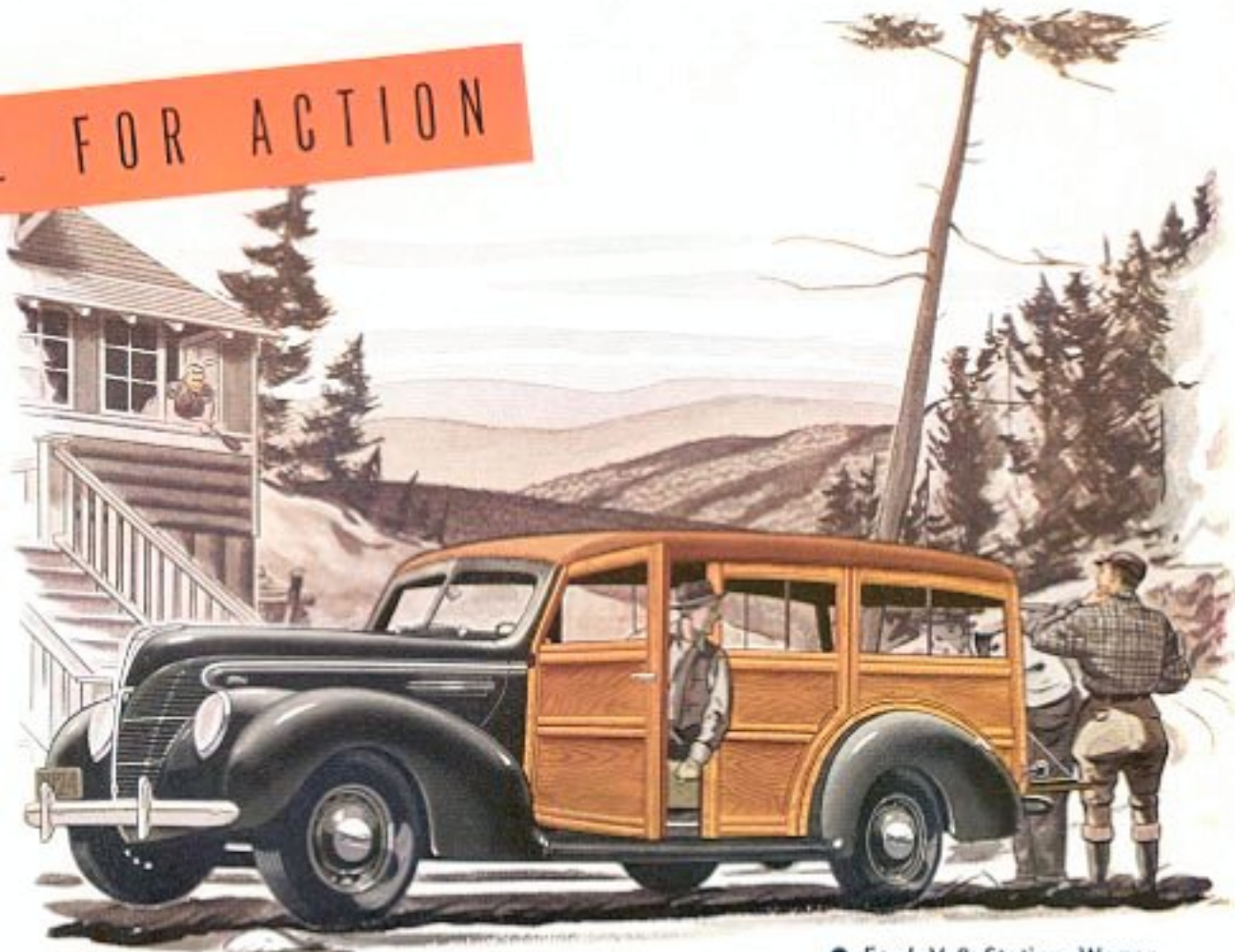
● Ford V-8 Station Wagon

FORD MOTOR COMPANY Makers of Ford V-8 Cars and Trucks, Mercury, Lincoln and Lincoln-Zephyr motor cars